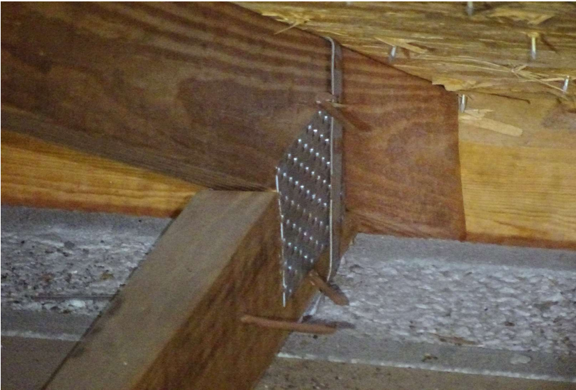
Single wrap with at least 2 nails in the embedded side and at least 1 nail in the wrapped side