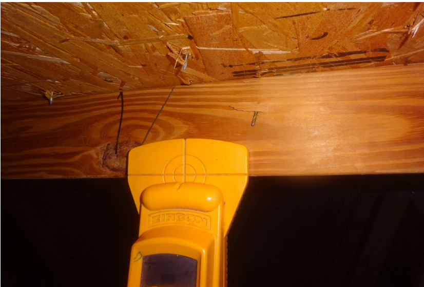
Nail location verified