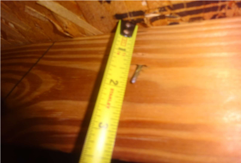
8d nails verified